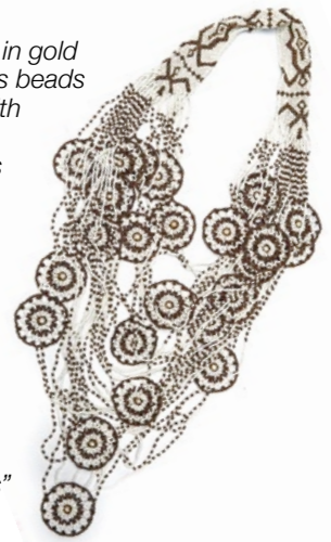
“This necklace in gold and white glass beads embellished with freshwater baroque pearls was inspired by the vibrant patterns of T’nalak, handmade by Tboli artisans from South Cotabato-based lifestyle brand Tribe Dreamweavers”