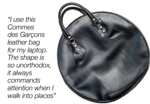
“I use this Commes des Garçons leather bag for my laptop. The shape is so unorthodox, it always commands attention when I walk into places”